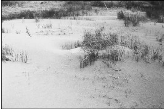
Figure 2: Juncus balticus growing on tailings

Low species richness on the tailings flats is related to the challenge of growing in a habitat low in moisture, organic material and nutrients, and high in toxic metals. However species able to establish here are having a positive impact. Cyanobacteria species are helping to prevent erosion and sedimentation as well as fixing nitrogen and adding organic material. Juncus balticus reproduces vegetatively, producing long rhizomes that create a network of plant cover that helps stabilize the substrate. Equisetum pratense naturalizes low, wet areas, takes up silicon, and also produces soil-stabilizing rhizomes.